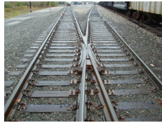
Photo: Railroad frog

Check out the new OGS logo on the front page of this newsletter!