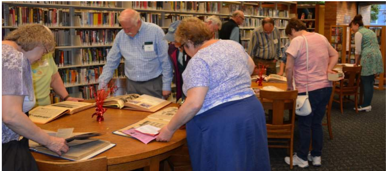
Scrapbooks chronicling the Olympia Genealogical Society’s 40 years maintained by the historian were a focal point for attendees of the Society’s 40th Anniversary open house and reception.