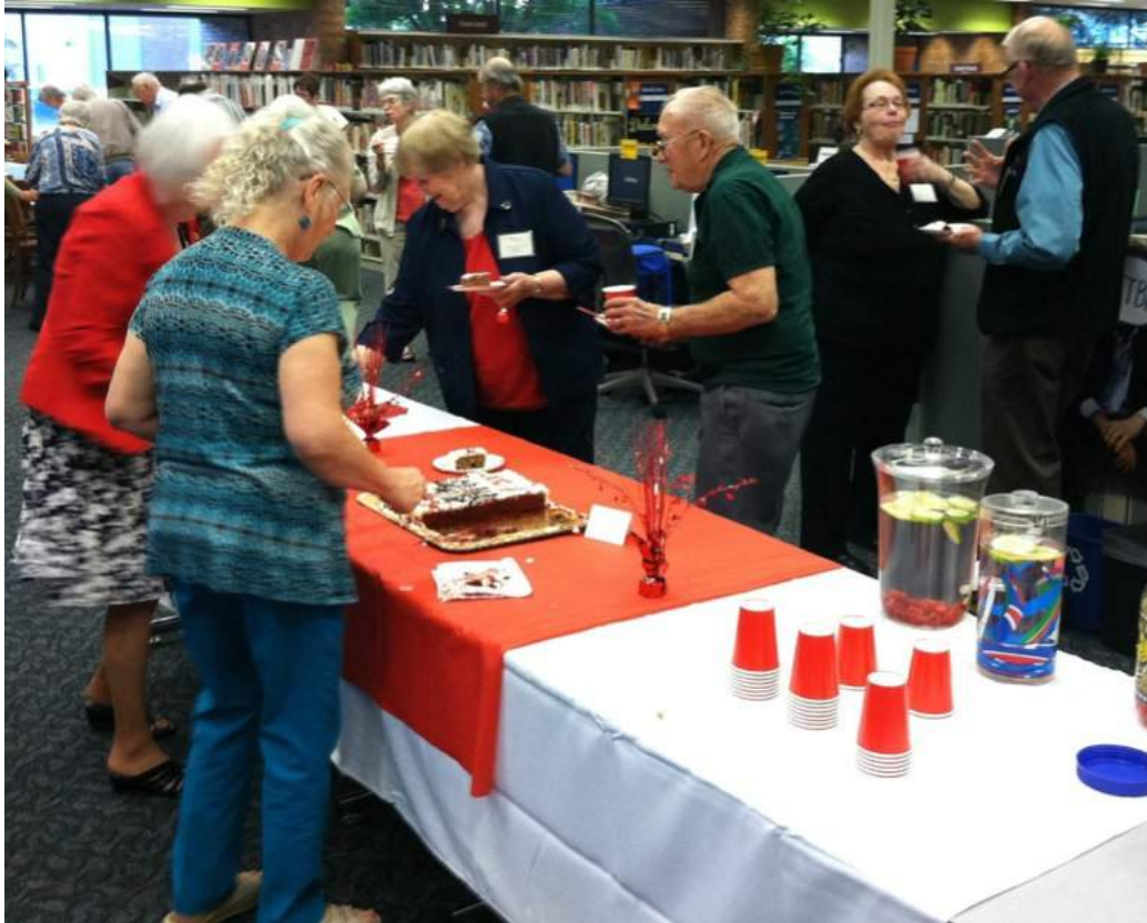
The refreshments and cake table at the Olympia Genealogical Society’s 40th Anniversary open house and reception provided a convenient location for members old and new to meet, greet, and discuss their research.